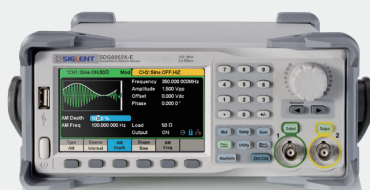
Arbitrary Waveform Generator