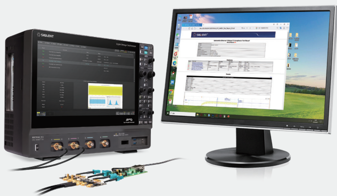
Oscilloscope (SDS7000A) & Software & Fixture