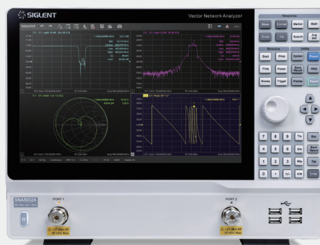
Vector Network Analyzer