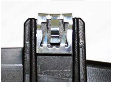
X Incorrect Figure 8