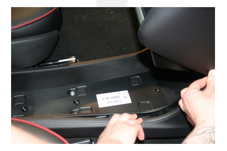
Figure 3 (RH shown)

2. Pull the front portion of the LH and RH wrapped trim panels away from the center console (Figure 3).