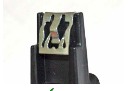
Correct Figure 7

NOTE: Make sure the clips are fully secured on the prongs (Figure 7) and are neither raised (Figure 8) nor angled (Figure 9).