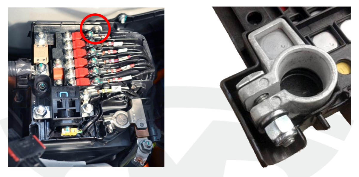
Figure 4 (Shown installed on Exide battery)

6. Remove and discard the nut that holds the existing positive adapter to the fuse box (Figure 4). Remove and discard the positive adapter (Figure 5).