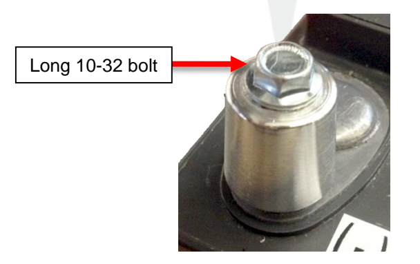
Figure 3 T ☰ ⊆ L 급

5. Use the longer 10-32 bolt to attach the negative adapter to the negative terminal of the new battery (torque 3.4 Nm) (Figure 3).