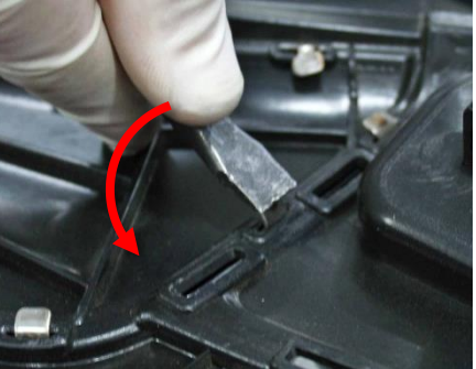
Figure 4 Figure 5

5. Reinstall the components that were removed.