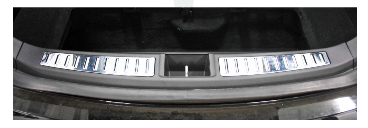
Figure 2 (Trunk sill)