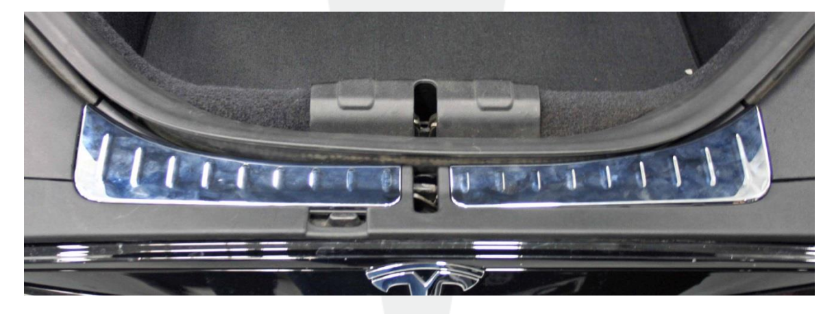
Figure 1 (Front underhood apron)

A set of chrome inserts for the front underhood apron and rear trunk sill (Figures 1 and 2) are now available as accessories for customer purchase. The kits include customer-facing installation instructions CD-13-10-001. However, if a customer is unable or unwilling to install the inserts themselves, service centers should use this service bulletin to install them.