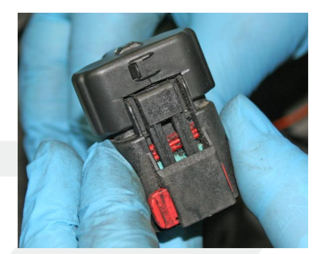
Figure 4 Figure 5

5. Repeat this procedure on the EPB caliper harness connector on the other side of the vehicle.