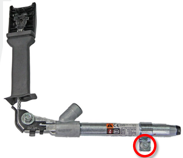
Figure 5 (LH side shown)