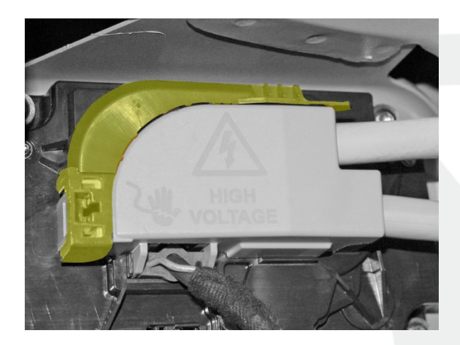
Figure 1 (Locking piece highlighted)