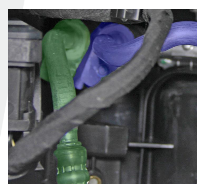
Figure 3 (A/C condenser pipes highlighted)