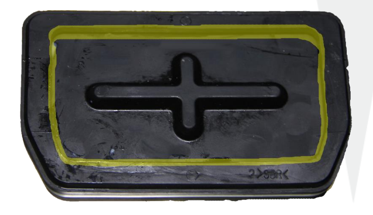
Figure 2 (Groove on brake pedal pads highlighted)

5. Apply a thin layer of P-80 Emulsion temporary rubber assembly lubricant to the mounting grooves on both pedal pads (Figures 2 and 3).