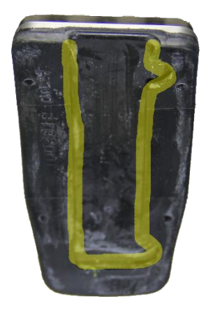
Figure 3 (Groove on accelerator pedal pads highlighted)