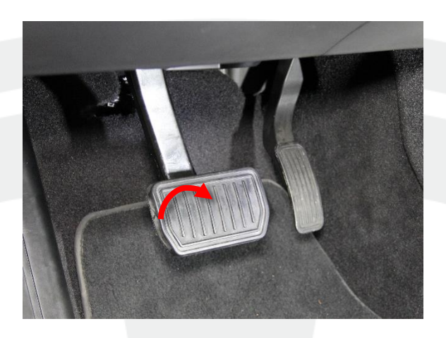
Figure 1 (LHD shown, RHD similar)

4. Clean the brake and accelerator pedals with an alcohol wipe. Allow the surfaces to air dry before continuing.