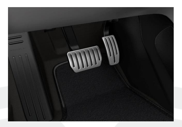
Figure 6 (LHD shown, RHD similar)

8. Verify that both pedal pads are correctly installed (Figure 6). Firmly press the pedals 3 times to ensure that the pedal pads stay on firmly and without any movement within the pedals.