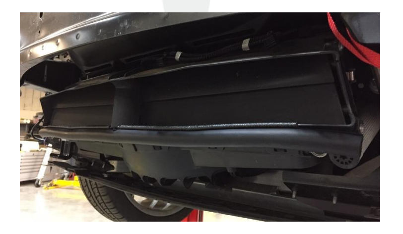
Figure 2 (Seal installed)