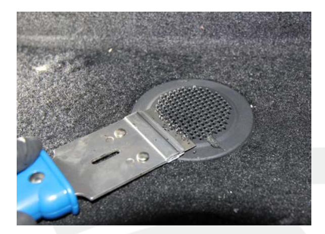
Figure 3 (Removing molded hooks)

3. Use the scraper to completely remove the molded hooks on the raised area of the anchors (Figure 3), making the anchors' surface smooth (Figure 4).