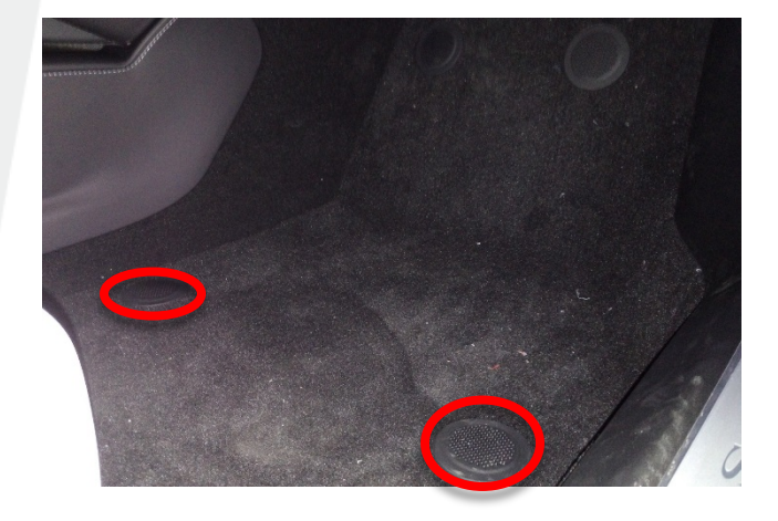
Figure 2 (Passenger side floor mat anchors)