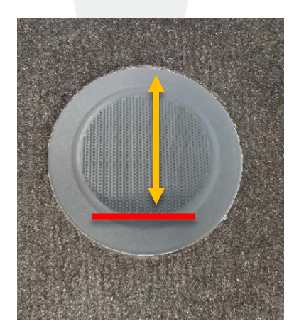
Figure 5 (Grain direction in yellow, flattened edge in red)

8. Peel the backing from the Velcro pads and align the pads to the center of the anchors, with the "grain" oriented front to back, and the flattened edge toward the rear of the vehicle (Figure 5).