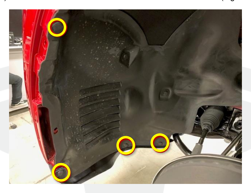
Figure 1 - Left front wheel removed for clarity

5. Remove the bolt that attaches the LH side of the front fascia to the fender (Figure 2).