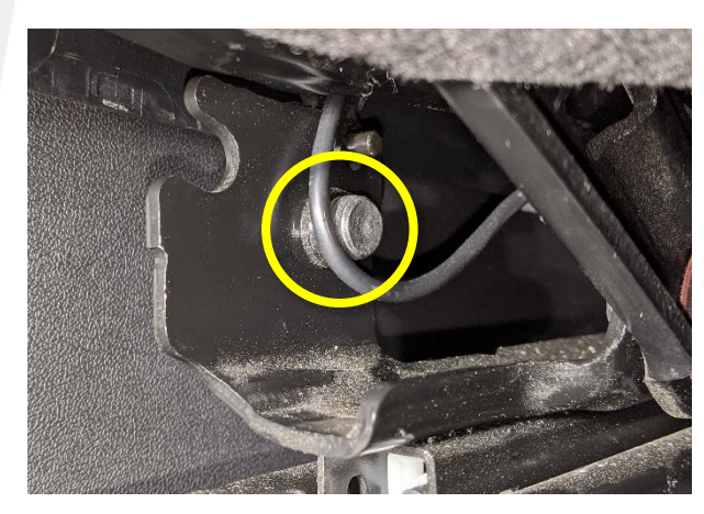
Figure 12 – Harness around the seat recliner bolt