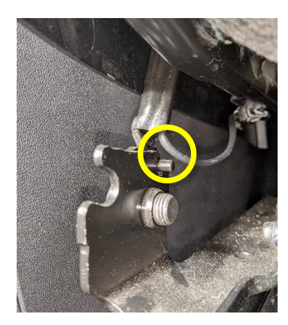
Figure 11 – Harness in front of the seat recliner bolt and alignment pin

d. Make sure that the harness is routed in front of the seat recliner bolt and the alignment pin (Figure 11), and not around it (Figure 12).