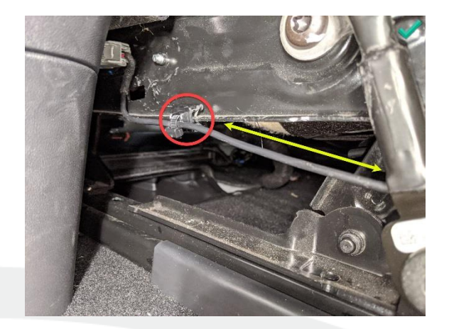
Figure 13 Figure 14