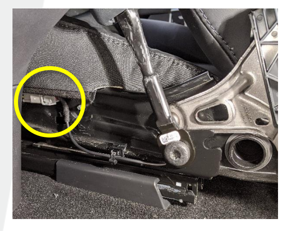
Figure 5 – Buckle electrical harness attached to