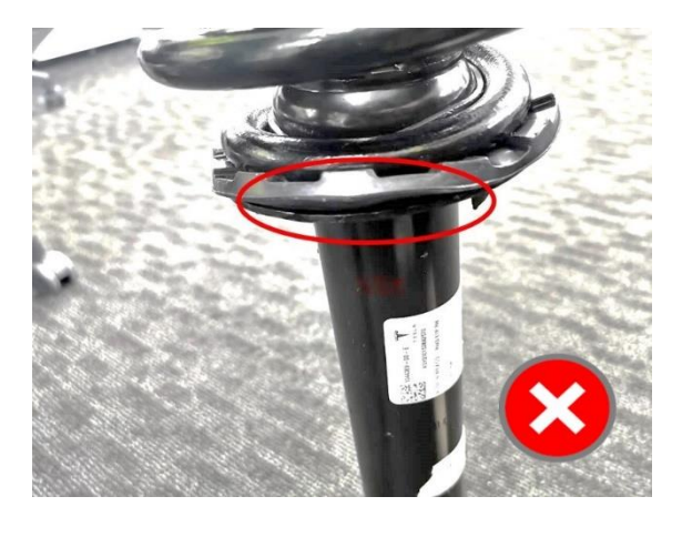
Figure 5 – Assembly removed from vehicle for clarity