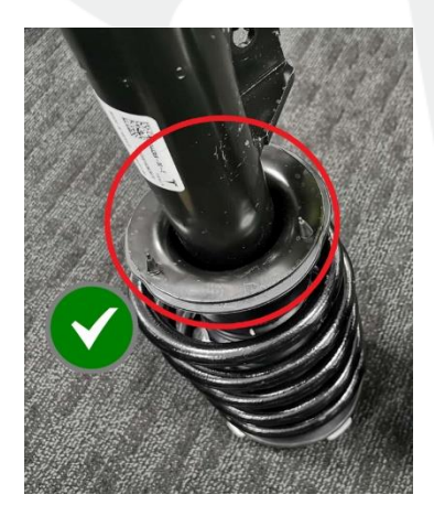
Figure 2 – Assembly removed from vehicle for clarity

• If the insulator is uniformly spaced on the spring perch and at no point protrudes more than 10 mm from the perch (Figures 2 and 3), that spring and damper assembly is within specification and does not need to be replaced. If both spring and damper assemblies are within specification, lower the vehicle and discontinue this procedure.