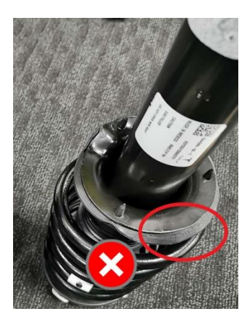
Figure 4 – Assembly removed from vehicle for clarity

• If the insulator is unevenly spaced on the spring perch and protrudes more than 10 mm from the perch (Figures 4 and 5), that spring and damper assembly is outside of specification and must be replaced (refer to Service Manual procedure 31151002).