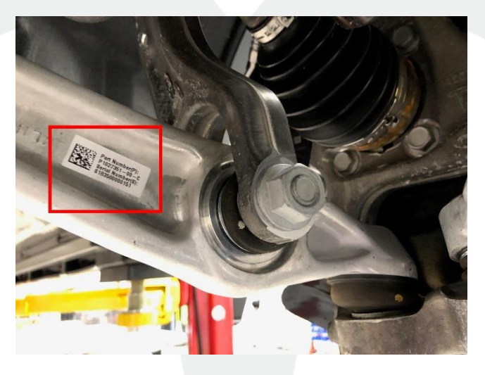
Figure 1 – Model S LH shown, Model X and RH similar