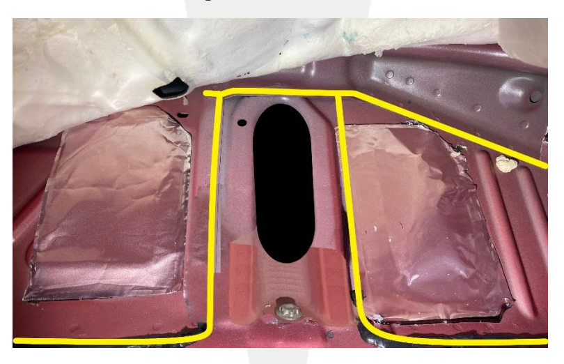
Figure 9 – Front passenger side