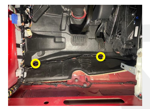
Figure 1 – Driver side