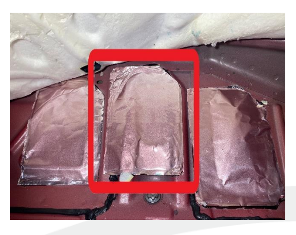
Figure 5 – Driver side

7. Remove both the driver and front passenger center side butyl patches to access the toeboard seams (Figures 5 and 6).