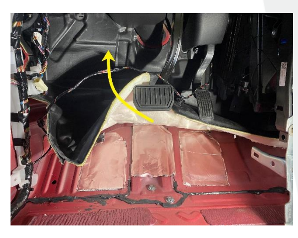
Figure 3 – Driver side

6. Fold back the lower sides of both the driver and front passenger dash insulator to gain access to the body panels underneath (Figures 3 and 4).