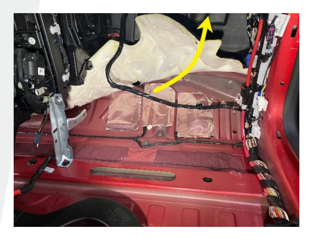
Figure 4 – Front passenger side