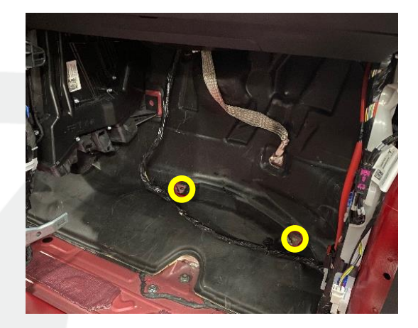
Figure 2 – Front passenger side

6. Fold back the lower sides of both the driver and front passenger dash insulator to gain access to the body panels underneath (Figures 3 and 4).