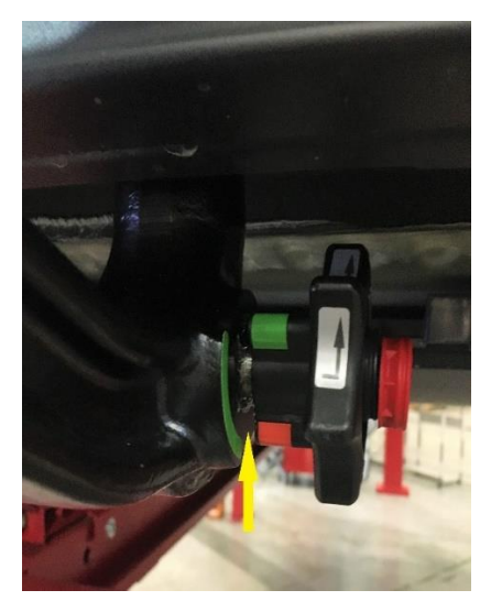
Figure 9 – Trailer hitch ball neck not securely seated