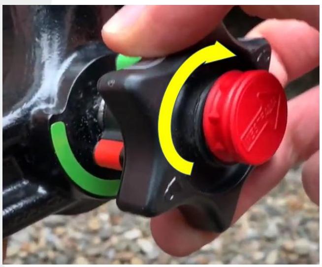
Figure 5 Figure 6