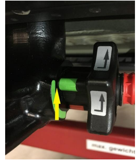
Figure 8 – Trailer hitch ball neck securely seated

In this case, repeat the procedure from step 3 onwards, using another new trailer hitch ball neck.