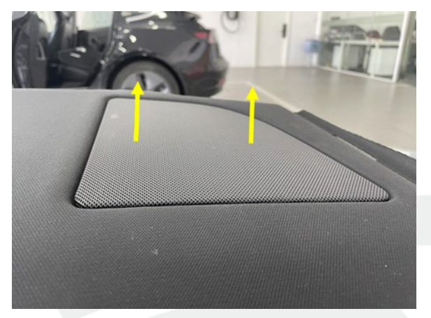
Figure 3 – LH Parcel Shelf Speaker Grille