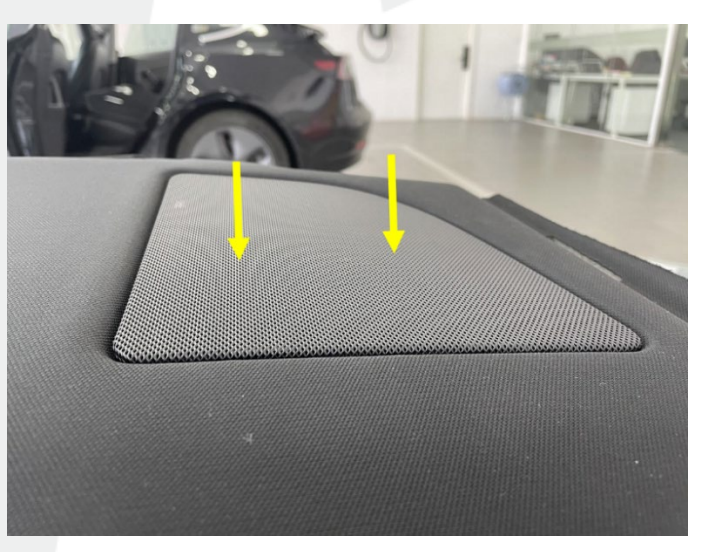
Figure 6- LH Parcel Shelf Speaker Grille

4. Install the package tray trim. (refer to Service Manual procedure <u>15243002</u>).