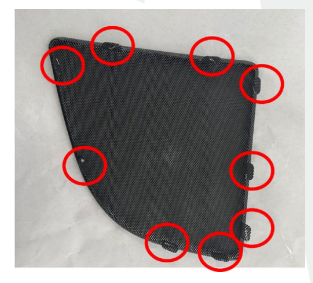
Figure 5- LH Parcel Shelf Speaker Grille

3. Position the LH and RH parcel shelf speaker grilles on the package tray trim, and then bend the grille tabs (Figure 5) to lock the grilles in place. (Figure 6).