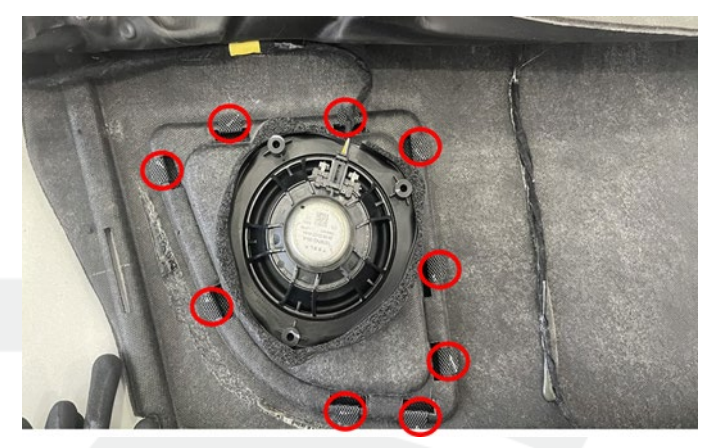
Figure 4 – LH Parcel Shelf Speaker Grille (Inside)

3. Position the LH and RH parcel shelf speaker grilles on the package tray trim, and then bend the grille tabs (Figure 5) to lock the grilles in place. (Figure 6).