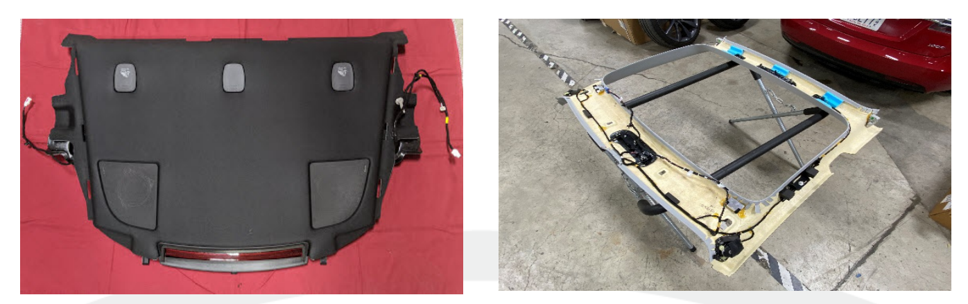
Figure 1 – Package Tray Trim

Inspect the speaker grilles on the package tray trim and headliner. (Figures 1 and 2).