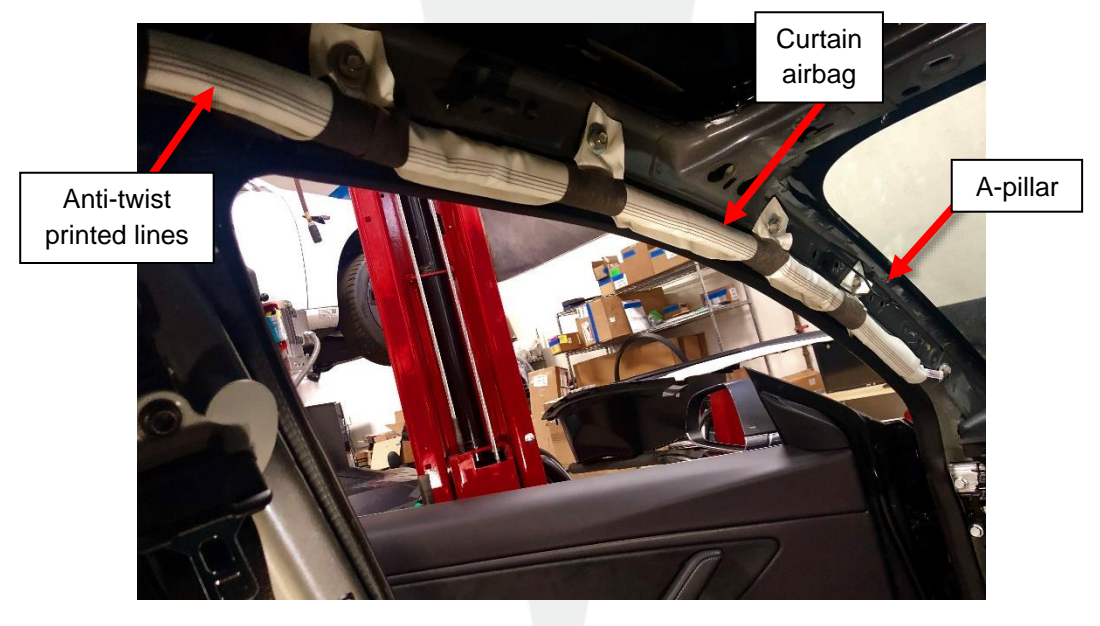
Figure 2 – LH curtain airbag, front view; RH similar