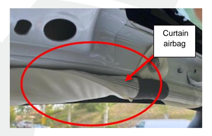
Figure 4 – Twisted curtain airbag; LH shown,