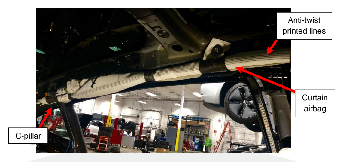
Figure 3 – LH curtain airbag, rear view; RH similar