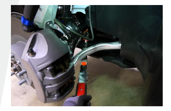
Figure 9 - Rear Bolt