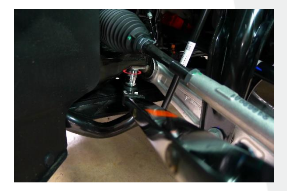
Figure 8 - Front Bolt