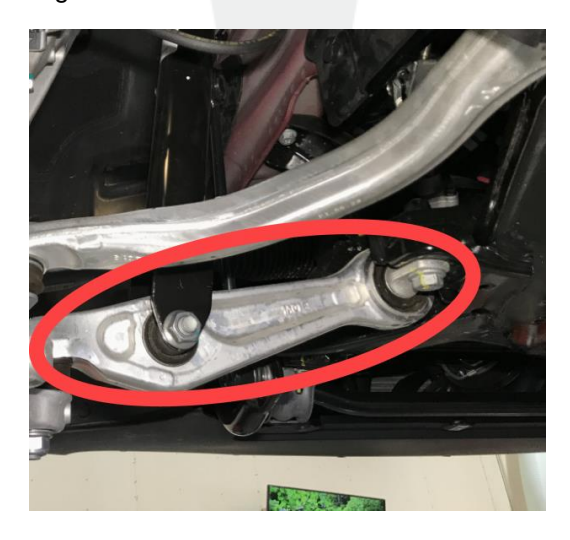
Figure 2 - LH shown; RH similar