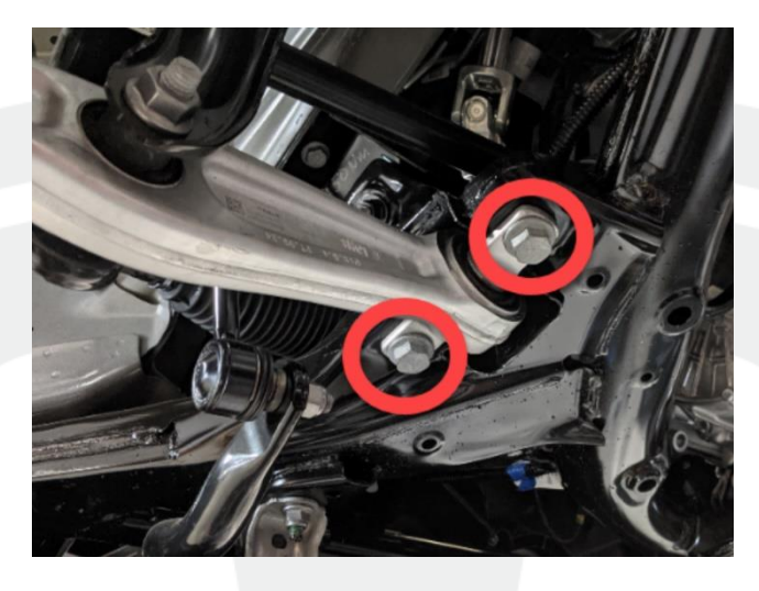
Figure 1 - LH shown; RH similar

CAUTION: Check that the bolt heads are fully flush with the lateral link flanges and that there are no gaps between the bolt heads, flanges, and subframe. Gaps between these components are a sign of possible cross threading and should be investigated.