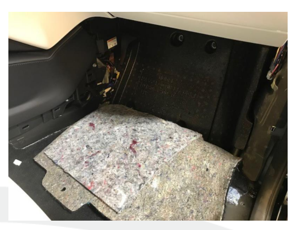
Figure 4 – LHD shown; RHD has pedals

7. LHD vehicles : Release the clips (Figure 5) that attach the front passenger footwell bracket to the vehicle, and then remove the bracket from the vehicle.