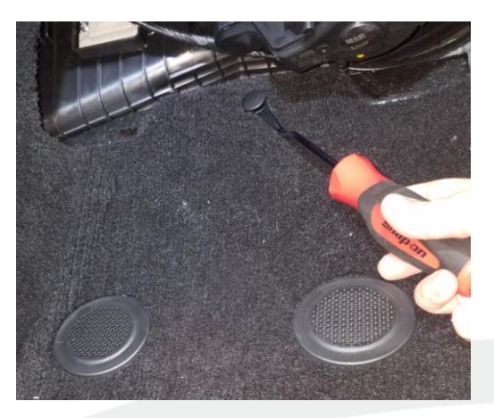
Figure 3 – LHD shown; RHD has pedals

6. Release the clip at the top of the RH front carpet (Figure 3), and then fold the carpet toward the rear of the vehicle (Figure 4).