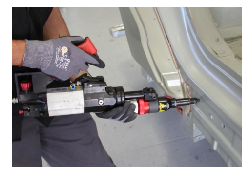
Figure 4 Figure 5