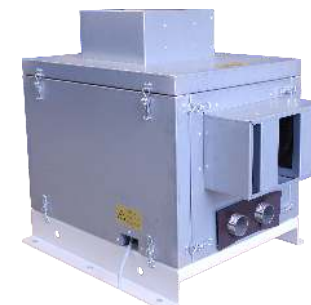
Acoustic enclosure TB 0310-AE (optional)