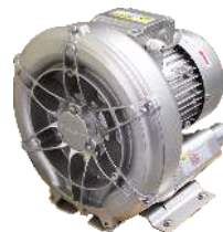
Cooling blower TB 0310