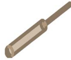
Graphic enlarged for detail