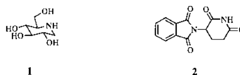
Fig. 1. Structures of 1-Deoxynojirimycin ( 1 ) and Thalidomide ( 2 )

In this paper, we describe preparation of N -cycloalkyl- and