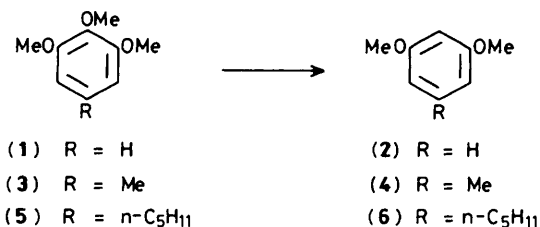
Scheme 1. Reagents and conditions: K, THF, room temp., 24 h.