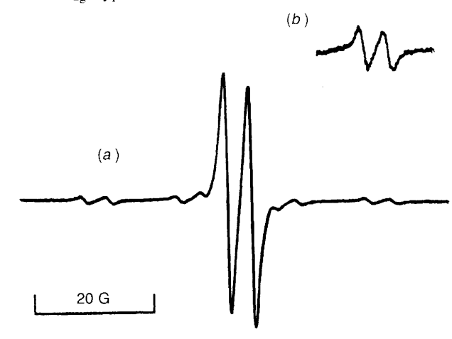
Fig. 1 (a) The room temperature ESR spectrum of [Cr(CO)_2(HC_2-Ph)(\eta-C_6Me_6)]^+ in CH_2Cl_2 : thf (2:1); (b) the high field doublet, \times 5

The EHMO calculations<sup>4,5</sup> were carried out on model complexes [Cr(CO)_2L(\eta-C_6H_6)]^+ ( L=PH_3 and \eta-HC_2H ) with idealised geometries and standard parameters. The key results are summarised in Fig. 2. For L=\eta-HC_2H the interaction of the half-filled d\pi orbital (a t_{2g} -like orbital on the d<sup>5</sup>-Cr<sup>1</sup> fragment) with the filled \pi_{\perp} orbital of the alkyne ligand has the effect of destabilising the SOMO and delocalising it onto the alkyne [in addition to delocalisation onto the carbonyl ligand, see Fig. 2(c)]. Related conclusions have been drawn from calculations on d<sup>4</sup> and d<sup>6</sup> [ML_2(\eta-alkyne)(\eta-C_5H_5)] species.<sup>6-8</sup> In contrast, there is no filled phosphine orbital of suitable energy to cause such an interaction and a different pattern of orbitals emerges, essentially of the familiar t_{2g} <sup>5</sup> type.