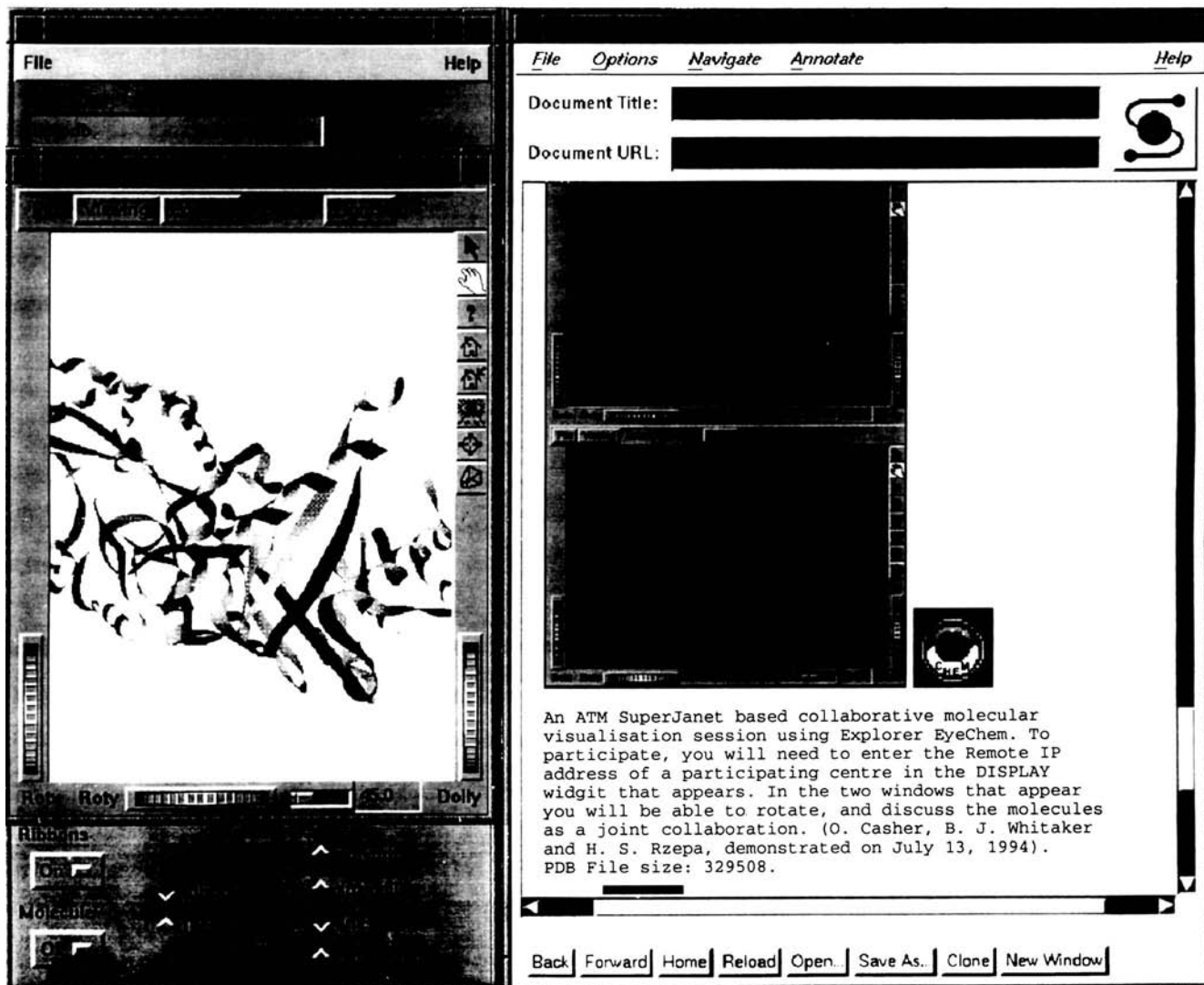
Fig. 1 The protein triose phosphate isomerase visualised using the EYECHEM package via a hyperlink to a 'thumbnail' diagram