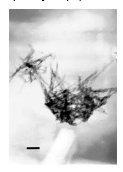
Fig. 2 TEM images of the nanowires (scale bar, 50 nm).

Fig. 3(a) shows the absorption spectrum of a sample dispersed in distilled water. The clear maximum at 455 nm is assigned to the optical transition of the first excitonic state. The average particle diameter, as calculated from the maximum of the absorption curve ( \lambda_m = 455 nm) is 3.8 nm² in good agreement with the TEM and XRD results. Since the onset of the absorption spectrum generally represents the larger end of