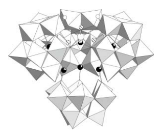
Fig. 2 Side view of [{Sn(CH_3)_2(H_2O)}_2{Sn(CH_3)_2}As_3(\alpha - AsW_9O_{33})_4]^{21-} (1). The color code is the same as in Fig. 1.