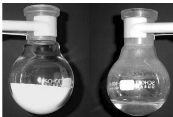
Fig. 1 Sorbitol (left) and a mixture of sorbitol/urea/ \text{NH}_4\text{Cl} (70:20:10) (right) at 80 °C.

The water content of a solvent is an important parameter, which was determined to be exemplary for the mixture of sorbitol (70), urea (20) and \text{NH}_4\text{Cl} (10) by Karl Fischer titration. Using vacuum-dried raw materials for preparation of the mixture, a typical water content of 0.07% was found; using raw materials as received, the water content is approx. 1.3% (see ESI†). A vapour pressure of 1.2 \times 10^{-1} mbar at 70 °C was determined for a melt of this composition. The thermal stability of some mixtures was investigated by differential scanning calorimetry (see ESI for data†). The melts are stable in subsequent heating–cooling cycles to 120 °C. For the mixture sorbitol (70), urea (20), \text{NH}_4\text{Cl} (10) a decomposition temperature of 220 °C was determined. The thermal behaviour is identical for mixtures prepared from dried or as-received raw material.