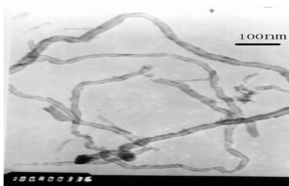
Figure 2 TEM photograph of pure carbon nanotubes

Figure 3 showed that rhodium and zinc oxide are loaded on support very well, it is important for this action. We think that higher catalytic activity may due to the special properties of the support, that has excellent behavior of transferring proton and electron 4 and storing hydrogen 5 . Therefore, when carbon nanotubes were used as a support, activation proton produced from syngas over promoter of the catalyst could be stored in CNTs. So concentrated proton around activation center favores greatly hydrogenation of CO to methanol.