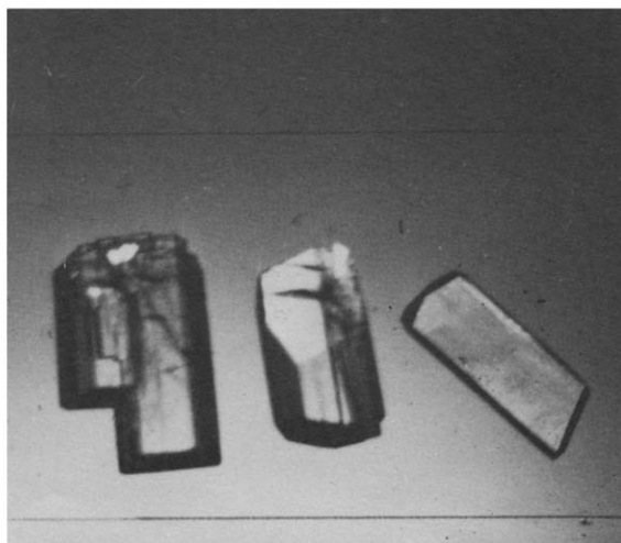
Fig. 1. Crystals of hen egg-white lysozyme obtained at pH 4.7 and 37° (orthorhombic form, called B form in this note). Magnification \times 5 .

From this point of view hen lysozyme has a behaviour which resembles an inorganic substance: there exists a polymorphism depending on one external physical parameter : the temperature leading to two forms A and B, the former seeming more metastable.