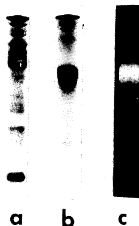
Fig. 2. Disc polyacrylamide electrophoresis of human liver \alpha -L-fucosidase preparation in discontinuous Tris (pH 9.0)–Tris–glycine (pH 8.5) buffer using 8% gels: a) ammonium sulphate fraction of human liver; b) 1% fucose eluate from column; c) Enzyme activity located by 4-methylumbelliferyl \alpha -L-fucoside.

There is thus a similar affinity for the proposed elutant and the ligand, despite the fact that the latter