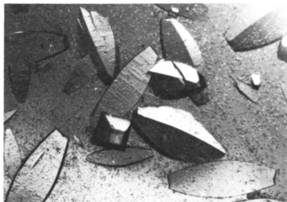
Fig. 1. Crystalline aspartokinase I-homoserine dehydrogenase I. Pyramidal crystals grown in plastic dishes at 4°C.