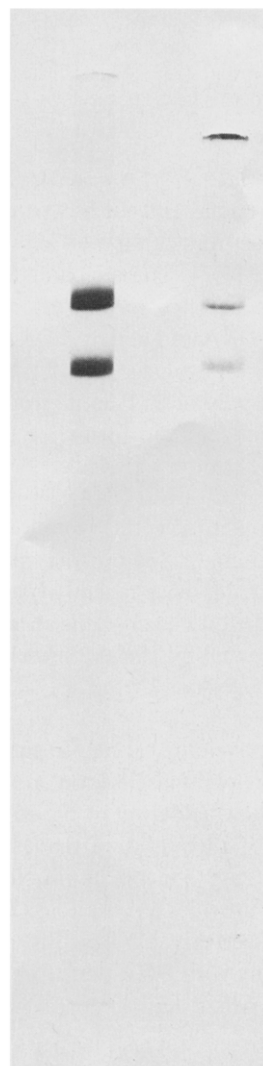
Fig.2. Polyacrylamide gels in the presence of SDS (10% acrylamide) of actin: DNAase I complex prior to crystallisation (a) and of carefully washed crystals (b) as described in text.

some were carefully washed with artificial mother liquor containing no protein and analysed by SDS-polyacrylamide gel electrophoresis (fig.2). Furthermore, when similar washed crystals were dissolved and assayed for DNAase I activity the rate of DNA degradation was typical for the actin: DNAase I complex, i.e., a lag phase of about 5 min followed by a reduced rate compared to free DNAase I (Mannherz et al., unpublished results).