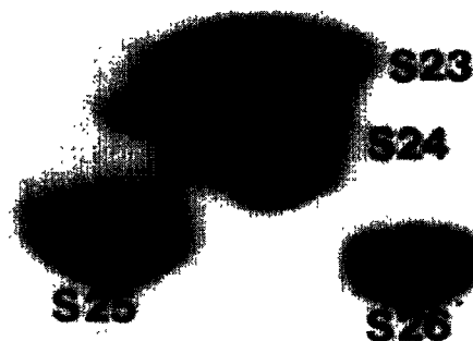
Fig.3. Two-dimensional polyacrylamide gel showing the partial resolution of S23 and S24. This is a region of a polyacrylamide gel stained with Coomassie brilliant blue after electrophoresis in two dimensions of a mixture of proteins from rat 40 S ribosomal subunits showing partial separation of S23 and S24.