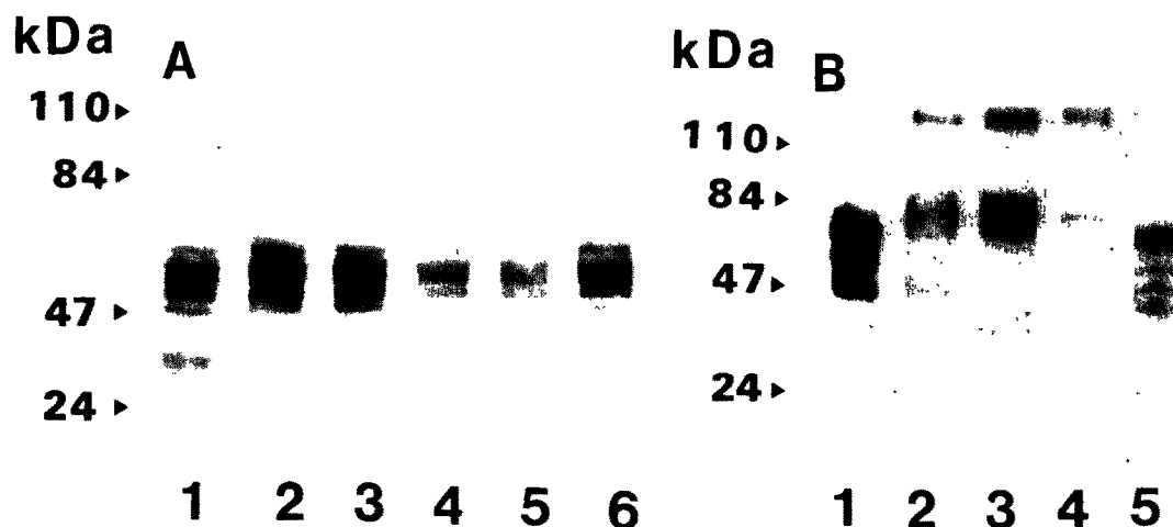
Fig. 3. Western blot analysis with the B19-1 antibody of the TAU variants present in Alzheimer and control brains (A) and in PHFs (B). (A) Heat-treated supernatants (20 \mu g) of Alzheimer (lanes 1–3) and control (lanes 4–6) brains. (B) Alzheimer brain supernatant (1). Alzheimer (2) and control (5) homogenates. Pellet (3) and supernatant (4) of PHF extracts.

the Alzheimer and the control brain supernatants with several TAU variants (50–65 kDa) present in both cases. The same pattern was obtained with the polyclonal 1E9 (not shown). None of these antibodies detected a TAU variant specific or present in higher quantity in Alzheimer brain supernatants.