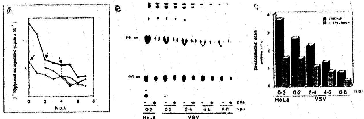
Fig. 3. Lipid synthesis in VSV-infected cell. Effect of cerulenin. (A) HeLa cells grown in 60 mm dishes were infected with VSV (50 pfu/cell). At different times post-infection, cells were incubated in medium containing 10 \mu\text{Ci/ml} [^3H] glycerol. Total lipids were extracted as described in Materials and Methods. ( \square ) Control VSV-infected cells; ( \bullet ) plus cerulenin added to the medium at the times indicated by the arrows. (B) Analysis by thin-layer chromatography (TLC) of phospholipids extracted from VSV-infected HeLa cells, incubated in the presence (+) or absence (-) of 0.08 mM cerulenin. 10 \mu\text{Ci/ml} [^3H] glycerol was present for 2 h. (C) Quantitation by densitometric scanning of the thin-layer autoradiography shown in (B).

cerulenin significantly inhibited the synthesis of lipids both in mock-infected and VSV-infected HeLa cells. In order to analyse specifically the synthesis of phospholipids, they were separated by thin-layer chromatography. Fig. 2B and C indicate that certainly the synthesis of phospholipids decreases throughout infection and that the presence of cerulenin further reduces this synthesis. Therefore, these results indicate that this inhibitor blocks the synthesis of both cellular phospholipids and viral RNA, soon after its addition.