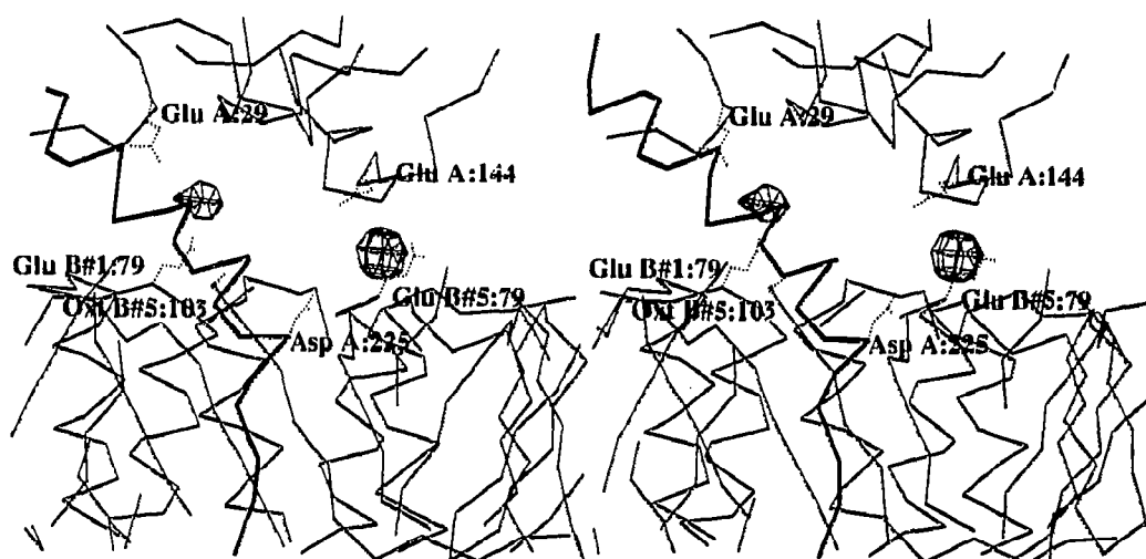
Fig. 2. Close up stereo figure of samarium sites in LT after coordinate refinement. The ligands of site no. 2, on the left side in the figure, are conserved in cholera toxin and may well be the site responsible for lanthanum inhibitor binding.

site is in a crystal contact between Glu B#5:11 and Glu A2:202 in two different molecules and will therefore not be discussed further.