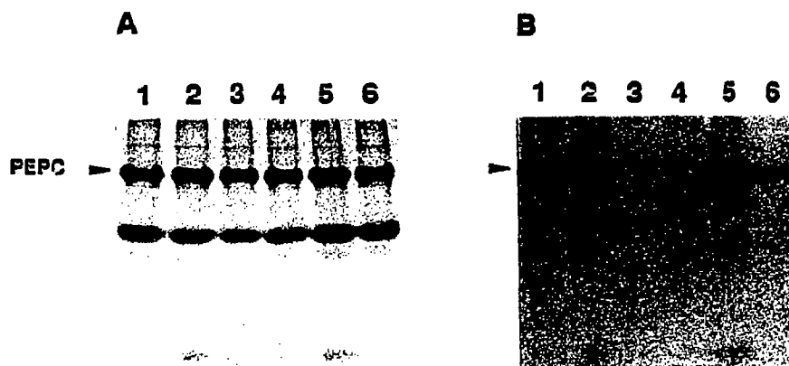
Fig. 1. Inhibition of PEPC-PK by K-252a derivatives. SDS-PAGE analysis of phosphorylation assays described in section 2 with (lanes 1–6, respectively) no inhibitor, 2.5% (v/v) DMSO (solvent of K-252a derivatives), 10 \mu M K-252a, 10 \mu M KT5720, 10 \mu M KT5823, 10 \mu M KT5926. (A) Coomassie blue staining. (B) Autoradiograph.

be the same (Ser 15 ) as the site phosphorylated by a mammalian cyclic AMP-dependent PK (A-kinase) [12] as judged from the behaviors of phosphorylated peptide on HPLC and TLC (data not shown). Furthermore, the conversion of PEPC to a more activated state was also brought about by the phosphorylation. To characterize PEPC-PK, the effect of a series of kinase inhibitors on PEPC-PK was investigated. K-252a produced by Norcardiopsis sp. is known to potently inhibit various types of PK's in competition with ATP [8,9]. The three derivatives from K-252a, namely KT5720, KT5823 and KT5926, selectively inhibit A-kinase, cGMP-dependent protein kinase and myosin light chain kinase (MLCK), respectively. K-252a potently inhibits these three types of kinase and phospholipid-sensitive \text{Ca}^{2+} -dependent protein kinases with almost equal K_i values. Figs. 1 and 2 show that K-252a and KT5926 strongly inhibited PEPC-PK activity in a concentration-dependent manner, and the concentration required for 50% inhibition ( \text{IC}_{50} ) was 5.0 and 2.5 \mu M, respectively. KT5720 and