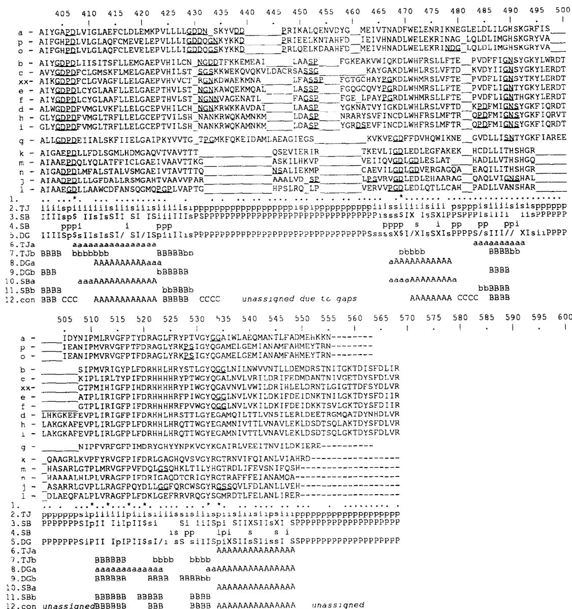
Fig. 1 (3rd part).

those made by a fully automated package that is essentially an 'expert system' attempting to reproduce assignments made by organic chemists using experience, training and intuition applying procedures described in detail elsewhere [1,2,5,6,11]. This is the first time this package has been applied. The second, third and fourth lines reflect two sets of predictions prepared independently by two experts (D.G. and S.B.). A comparison of these lines illustrates the range of assignments made when relying on the experience, training, and intuition of individual scientists.