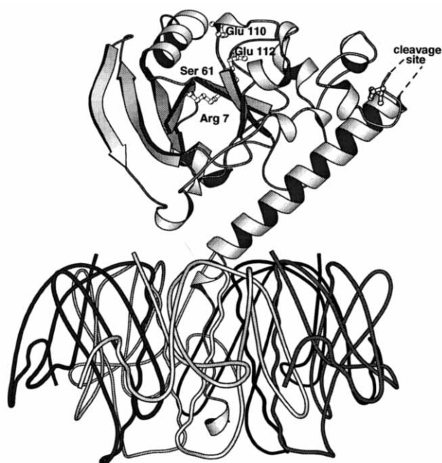
Fig. 1. Three-dimensional representation of LT AB 5 structure (program MOLSCRIPT [22]). The two domains of the A subunit are clearly visible, with A 1 forming an inverted cone at the upper left of the figure, and A 2 comprising the long helical region whose tail extends through the central pore of the B pentamer. Sidechains of residues implicated as active site residues are shown in ball and stick representation, as is the disulfide bridge between residues A187 and A199. The cleavage site is located at the juncture of the two domains, and is physically remote from the region of the A 1 domain tentatively identified as the active site. For clarity, the B subunits are depicted as a simplified backbone tracing so that the carboxy-terminus of the A subunit (RDEL signal sequence) is not obscured.

accessibility of the substrate binding site, or a possible conformational change which promotes catalysis. The present report describes the crystallographically determined structure at 2.6 Å resolution of the LT AB 5 holotoxin in which the peptide chain of the A subunit has been cleaved, but the linking disulfide bond has not been reduced.