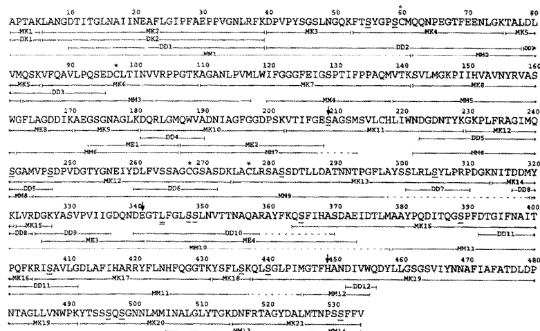
Fig. 3. Primary structure of cholesterol esterase from Candida cylindracea , together with a summary of analytical results for all peptides investigated. Peptide nomenclature: first letter (M or D) denotes origin from the monomeric and dimeric preparations, respectively; second letter denotes cleavage method, K for the Lys-C protease, E for the Glu-C protease, D for the N-Asp protease, and M for CNBr. Parts of peptides analyzed by sequencer degradations are indicated by solid lines, remaining parts, analyzed by total compositions only, by broken lines. The Ser-His-Glu catalytic triad is indicated by arrows, the four highly conserved Cys residues by asterisks, the microheterogeneity toward a DNA report [6] by double underlining, and the residues corresponding to CTG codons in the DNA (usually coding for Leu) but in Candida expected to code for Ser [4,7] and now also directly proven to do so at all 15 positions by single underlining.