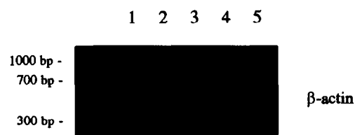
Fig. 1. RT-PCR in peritoneal cells. Agarose gel electrophoresis of RT-PCR products for \beta -actin mRNA from total peritoneal cells and rat basophilic leukemia (RBL) cells. First lane, DNA size standards; lane 1, PCR products from peritoneal cells RNA (3 \mu g) obtained after 60 cycles at 95°C 15 s, 50°C 25 s, 72°C 20 s; lane 2, PCR products from RBL RNA (0.5 \mu g) obtained after 30 PCR cycles; lane 3, PCR products from a 1:1 mixture of RBL and peritoneal cells RNA (1 \mu g of each); lane 4, PCR products from peritoneal cell RNA (1 \mu g) treated with heparinase; lane 5, PCR products from RBL cell RNA (0.5 \mu g) treated with heparinase. The PCR products in lanes 3 to 6 were obtained after 30 cycles at 95°C 15 s, 54°C 25 s, 72°C 20 s.

Total peritoneal cells (~50% macrophages, ~2% mast cells) were isolated from a mouse or a rat by peritoneal lavage. RT-PCR was performed as previously described [25]. 1–3 \mu g of RNA were reverse transcribed with a mixture Moloney Murine Leukemia Virus (MMLV) reverse transcriptase and random hexamer primers. However, when the cDNA product was subjected to PCR using primers for \beta -actin, no bands were detected after