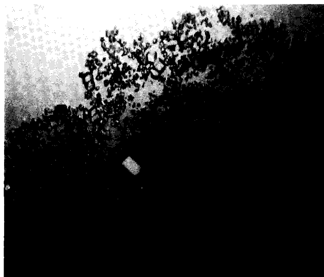
Fig. 2. Crystals of vanadium-dependent haloperoxidase from Corallina officinalis , grown from PEG 6,000. Crystal dimensions were typically 0.3 × 0.3 × 0.3 mm.