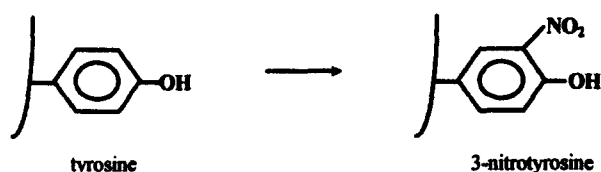
Fig. 2. Detection of RNS-induced damage detection of short-lived and reactive species such as many of the RNS is difficult but some of the reaction products are stable. One important example is nitration of aromatic amino acids, which occurs by their reaction with \text{ONOO}^- , probably via \text{NO}_2^+ and \text{NO}_3^+ . Tyrosine is especially sensitive, giving a nitrotyrosine adduct which can be measured by HPLC [19,32] (directly or after reduction to aminotyrosine, which can be detected electrochemically, giving increased sensitivity), by GC/MS or by antibodies directed against nitrated proteins [23]. Nitrotyrosine is excreted in human urine and as such might be useful as a total body marker of RNS [54]. Other potential markers for RNS include nitrate/nitrite, nitrosothiols, oxidation of oxyhaemoglobin, depletion of antioxidants, deaminated DNA bases, 8-nitroguanine and the formation of end-products of the reactions of RNS with \text{LO}_2^+ and \text{RO}^* during lipid peroxidation, such as \text{LOONO} (Fig. 1).

recently been shown that oxidised LDL decreases the expression of endothelial NO • synthase [26]. It is attractive to hypothesize that the loss of endothelial NO • production plays a role in phagocyte adhesion and activation at sites of injury, as occurs after ischaemia-reperfusion [27].