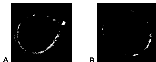
Fig. 3. Confocal images of insect cells expressing HGH (A) and HRH (B). The pigments were detected with antibody CERN956.

The cone pigment proteins were regenerated into photosensitive pigments by incubation of infected insect cells with 11- cis retinal and were subsequently solubilized by the addition of CHAPS. The solubilized samples were analyzed by UV-Vis spectroscopy. The \lambda_{\text{max}} of the green pigment can be read directly from difference spectrum (Fig. 4A). In the difference spectrum of the red pigment, however, some spectral impurities are present (probably of heme pigment origin) that disturb the spectrum and hamper direct reading of the \lambda_{\text{max}} . Accordingly, \lambda_{\text{max}} values were calculated by fitting the long wavelength limb of the absorption curve to a template derived by Partridge and DeGrip [17], designed for vitamin A1-based visual pigments. In this way a \lambda_{\text{max}} was obtained of 560 \pm 1 nm and 527 \pm 1 nm, for the red and green cone pigment, respectively. For comparison, we also expressed a non-histidine tag containing (wild type) human red cone pigment, which displayed a maximum sensitivity at 555 \pm 1 nm (Fig. 4B). Besides the absence of the histidine tag, the latter pigment also differs in the amino acid present at position 180 (a polymorphic site in the red pigment [18]). The wild type pig-