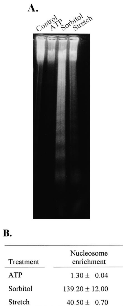
Fig. 2. Effects of secretagogues and stretch on DNA fragmentation. Cells cultured on Flex I/II plates were washed and incubated for 7.5 h following 30 min of stretch or for 8 h in the presence of either 1 mM ATP or 0.4 M sorbitol. A: Cells were prepared for in-gel digestion and analysis of internucleosomal DNA fragmentation by agarose gel electrophoresis. DNA was stained with ethidium bromide, visualized under UV light and the gel photographed. B: Cells were harvested and lysates prepared for analysis of released oligonucleosomal DNA using a cell death ELISA kit. Nucleosomal enrichment factors ( \times 10^{-5} ) were calculated from absorbance readings measured at 405 nm and are expressed for each treatment as mean \pm S.E. of three replicate determinations relative to a control.

apoptosis is the activation of caspases, a family of cysteine proteases which participate in a cascade that is triggered in response to apoptotic signals and culminates in the disassembly of the cell [16]. For many stress-related apoptotic stimuli caspase activation is frequently preceded by the release of mitochondrial cytochrome c into the cytosol where it binds with Apaf-1 and procaspase-9. This results in the activation of caspase-9 which in turn cleaves procaspase-3 into activate subunits [17–20]. In the present experiments 30 min of cyclic stretch induced a moderate activation of caspases after 6 h (Fig. 3) as measured with a synthetic fluorogenic substrate with some selectivity for caspase-3. Continuous exposure to sorbitol for this period caused a marked activation of caspases, while ATP had no detectable effect. Together these