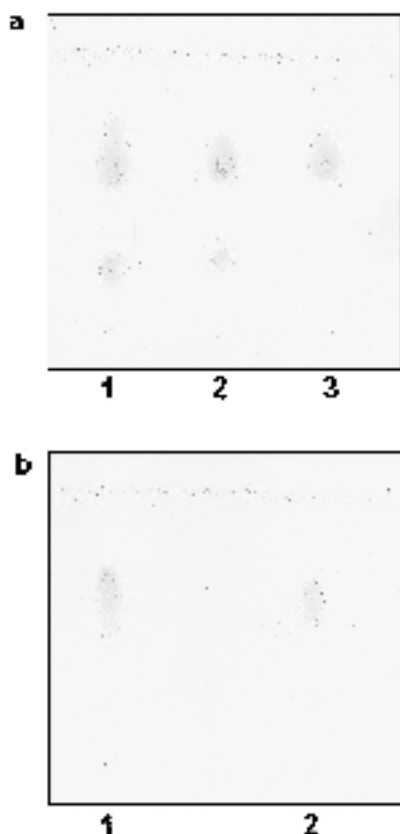
Fig. 3. One-dimensional chromatography on TLC. a_1 : PC and SM standard (from the top); a_2 : experimental sample; a_3 : the same sample after SMase digestion. b_1 : PPC standard; b_2 : experimental sample. The solvent used was chloroform/methanol/ammonia (65:25:4 by vol.) (a) and chloroform/methanol/ammonia/H 2 O (65:25:4:10 by vol.) (b).

this case also the two enzymes seemed to be different on the basis of their catalytic properties [17]. It is evident therefore that synthesis and hydrolysis of SM take place directly at the level of this nuclear structure. In hepatocyte nuclear complex two main PLs are present: PC and SM. Hydrolysis of SM permits the digestion of the residual RNA with RNase, thus suggesting a possible interaction between SM and nuclear RNA [28]. The PC present may represent the source for SM synthesis. SM synthase is present in this complex [28]. Therefore, it appears that the turnover of SM takes place inside the nucleus and the activities of the enzymes are mutually regulated.